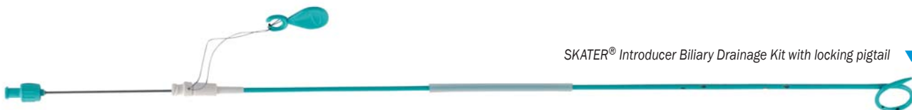
SKATER® Introducer Biliary Drainage Kit with locking pigtail ▼